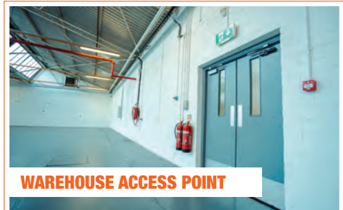
WAREHOUSE ACCESS POINT